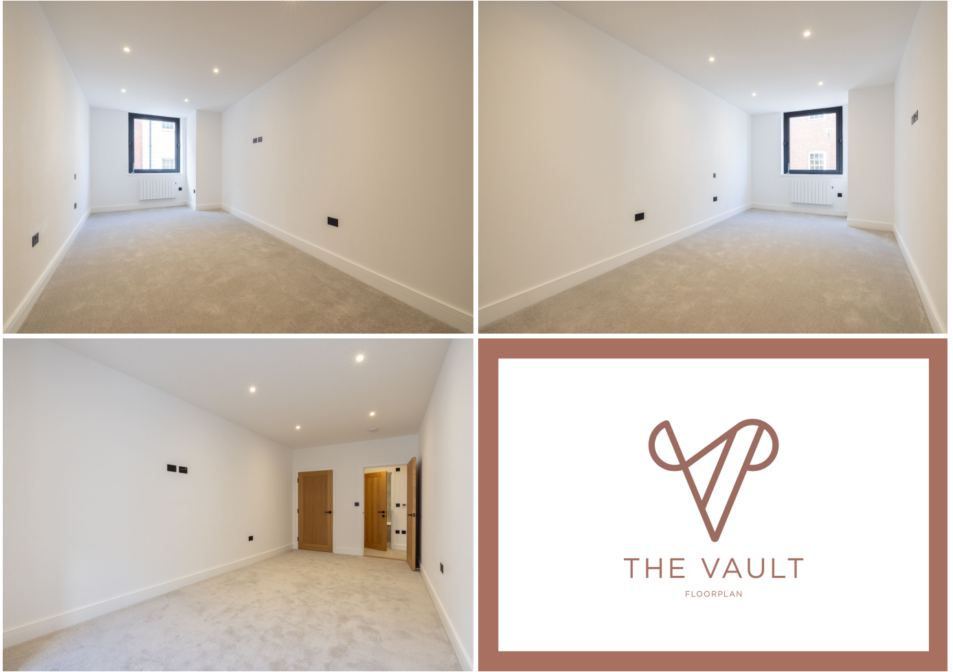
FIRST FLOOR 716 sq.ft. (66.5 sq.m.) approx.