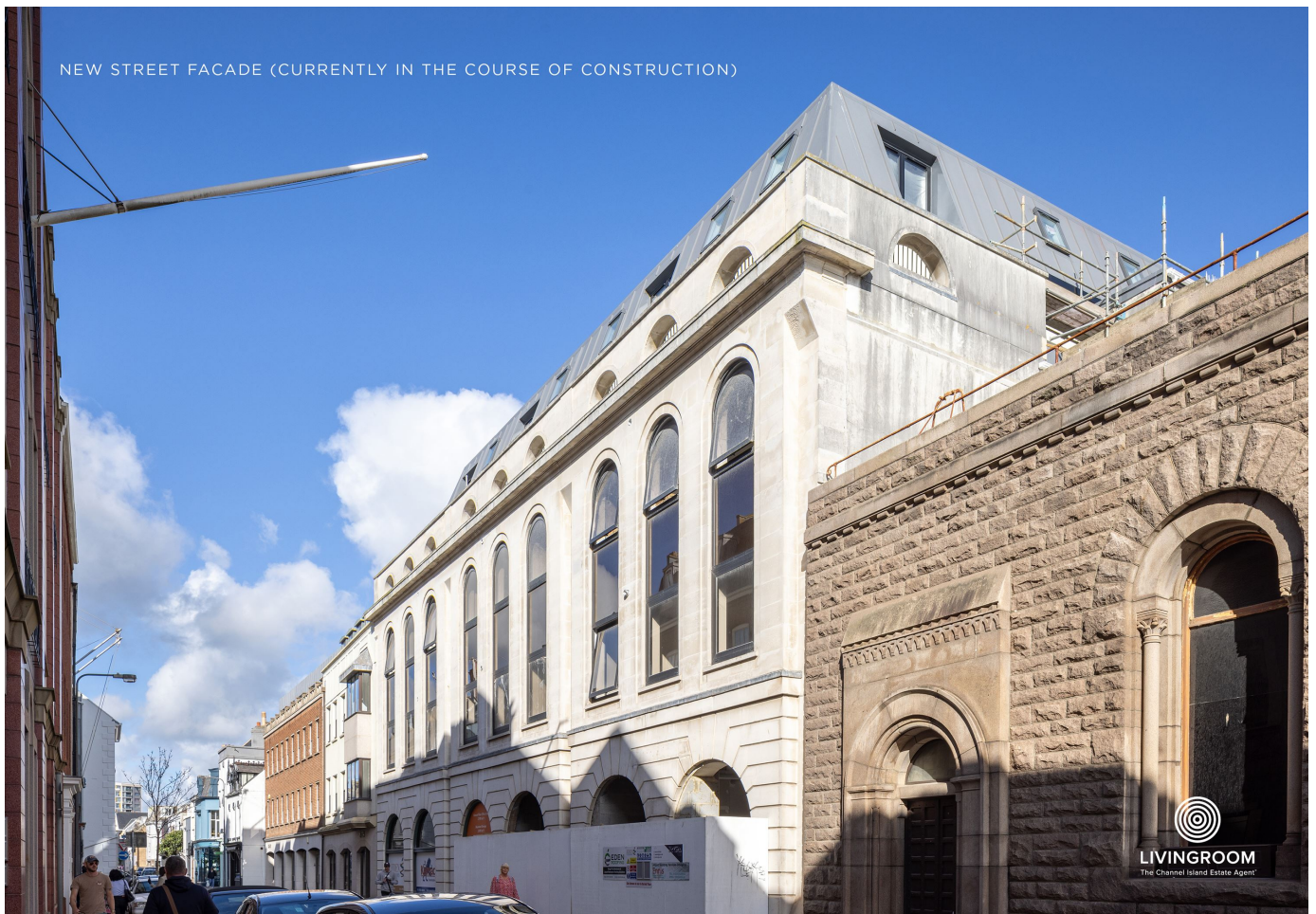
NEW STREET FACADE (CURRENTLY IN THE COURSE OF CONSTRUCTION)